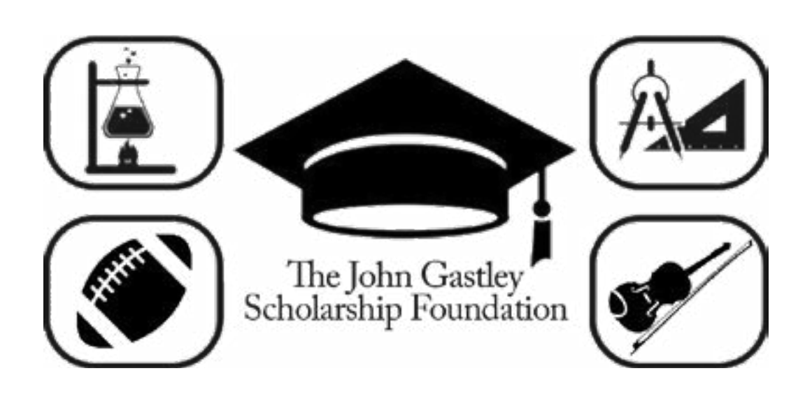
2024 Scholarship Application